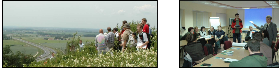
Figure 1 Workshop participants on field visit and discussing back in the 'office' again (Poland)