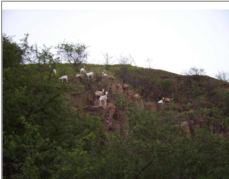
Figure 1. Goat grazing on the site Mücheln in the upper Saale river valley (Friedrich 2007)

were planned and implemented for all sites. Here we present first results of the grazing site “Mücheln” which was the project sites we could start with the grazing regime already in early summer 2007 whereas at the other four sites grazing started in autumn 2007. We explored the following objectives: (1) Which feed sources do the goats predominantly consume? (2) Are there seasonal differences in feed sources? (3) Which areas do the goats predominantly use and are there negative effects on occurrences of rare plant species? (4) How fast brush encroachment can be reduced and which group of herbal plants benefits from the decline of shrubs?